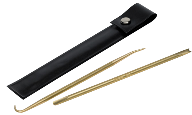
Brass pick and spat shown above.

Note: Private labeling is available upon request.